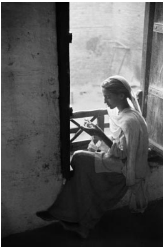
05_ Frank Horvat, Karachi, Pakistan, 1952