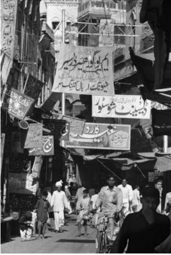
01_ Frank Horvat, Bazaar, Lahore, Pakistan, 1952