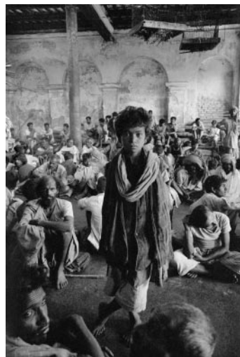
12_ Frank Horvat, Beggar assembly, Calcutta, India, 1962