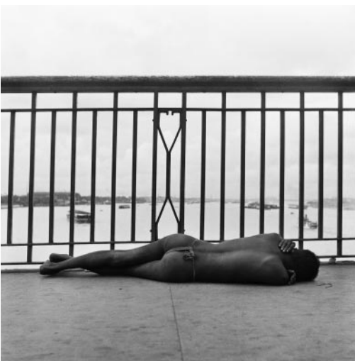
11_ Frank Horvat, Howra Bridge, Calcutta, India, 1953