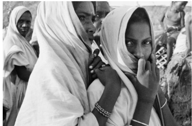
06_ Frank Horvat, Women listening to Vinoba Bhave speech, Bihar, India, 1953