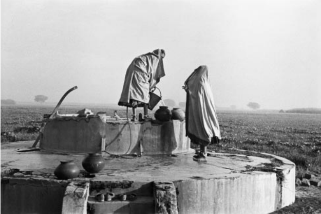
07_ Frank Horvat, Women at a village well, Punjab, India, 1952