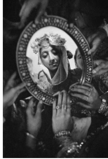
02_ Frank Horvat, Husband discovering the face of his wife in a mirror, Lahore, Pakistan, 1952