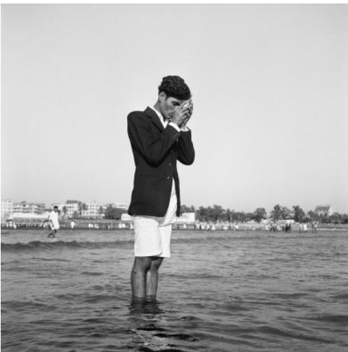
09_ Frank Horvat, Man praying, Bombay, India, 1953