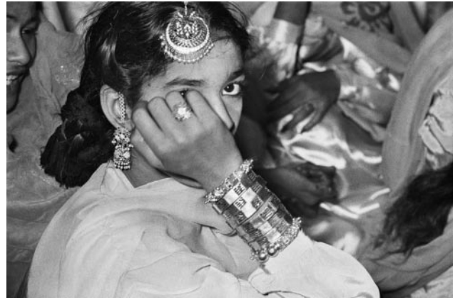
04_ Frank Horvat, Red-light district of Hira Mandi, Lahore, Pakistan, 1952