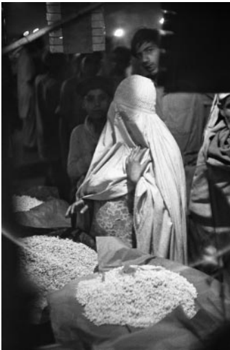
03_ Frank Horvat, Night market, Lahore, Pakistan, 1952